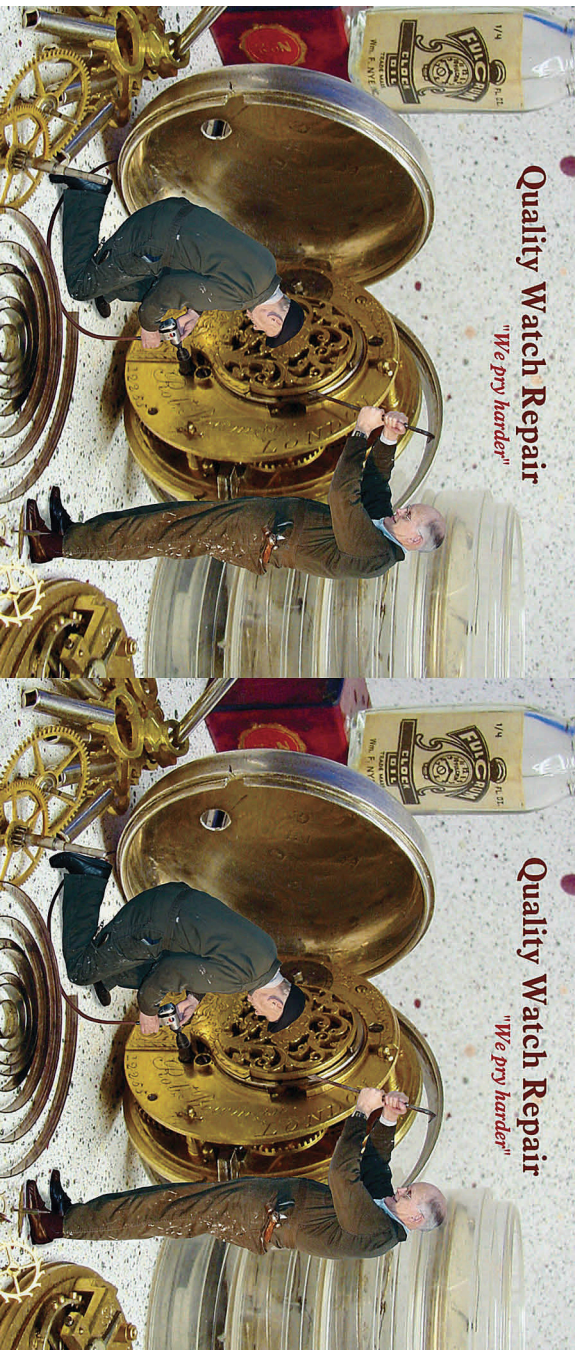
— altered reality ("fake news") photo courtesy of David W. Allen —

— The educational agenda of CSC is to teach anyone interested how to capture the reality of what we see in those original three dimensions. The most popular methods involve stereo photography. By making an image of the same scene from two slightly different positions at the same time, a stereoscopic photograph is created. By viewing the two images in such a way that the left image is presented only to the left eye, and the right image to the right eye, the image is seen in true stereoscopic 3D. Your brain does it and the resulting image has all the cues of a flat photograph, —